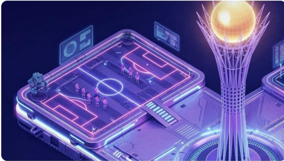
Illustration from the Games of the Future Facebook page