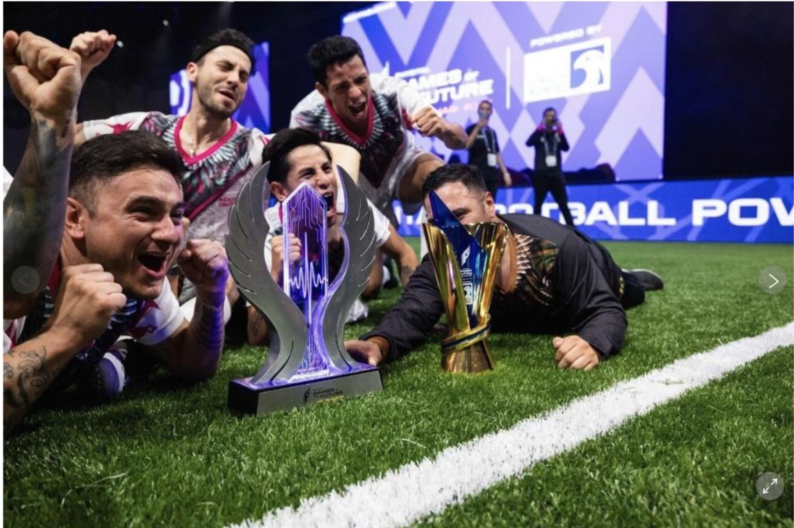
1 of 3 | Phygital Football winners at GOTF 2025