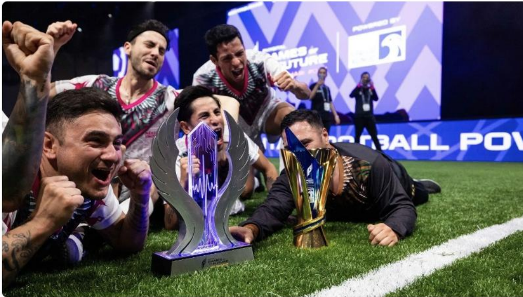
Mexico Quezales celebrating the Phygital Football championship conquered in the 2025 Abu Dhabi GOTF. PHYGITAL INTERNATIONAL

Phygital International, the contest's global promoter, announced this week that the application window for host cities is now open, inviting them to play a leading role in the future of sport as the movement continues to expand worldwide.