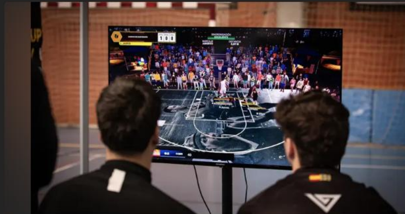
Phygital Rivals Valencia: this is the future of hybrid sport in Spain

The Story of Miguel Poblet • 2 week(s) • 3-minute read