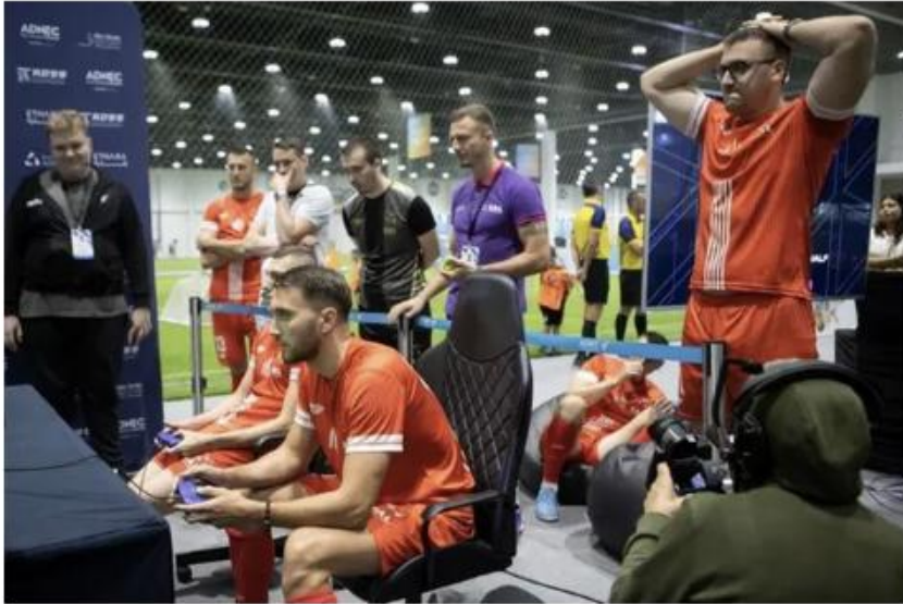
UAE esports reaps rewards of strategic development.