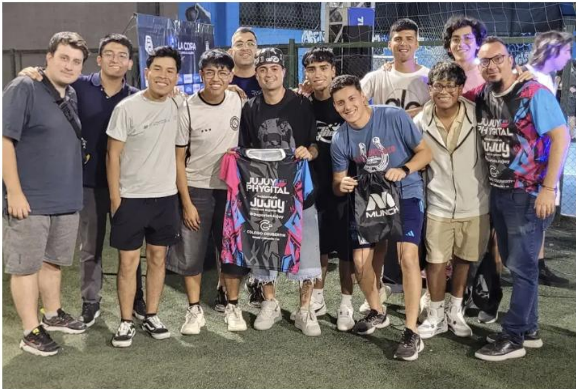
The future of sport: Jujuy Phygital, among the eight best teams in Argentina ( Via Jujuy )