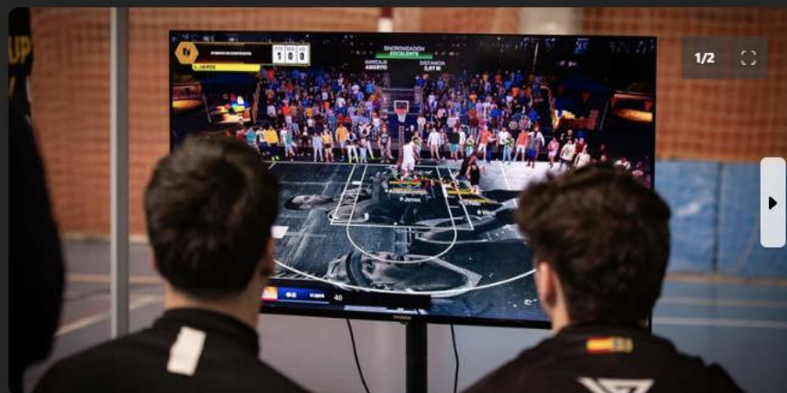
Digital phase of Phygital Basketball in Valencia